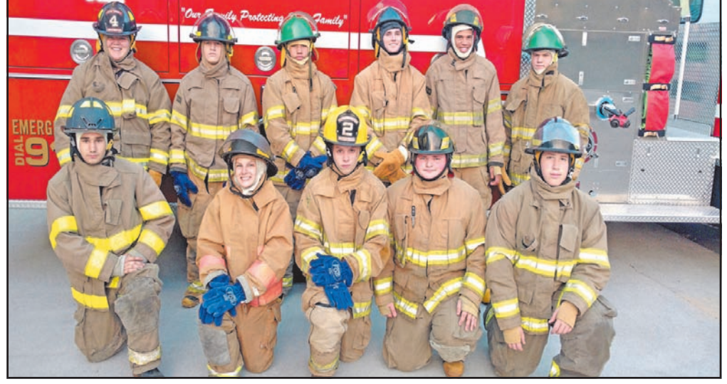
The first group of Union County Fire Department Junior Firefighters.