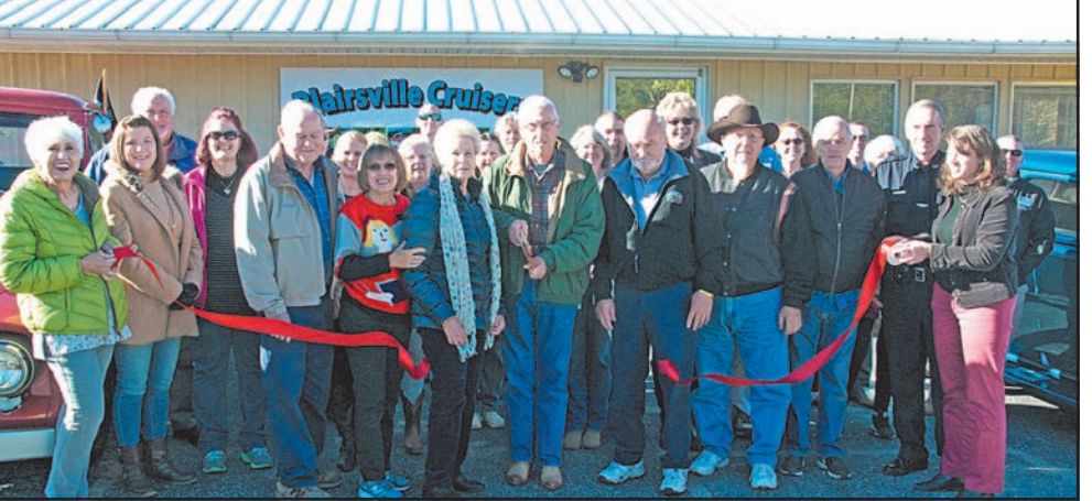
The Blairsville Cruisers with the Blairsville-Union County Chamber of Commerce for the Oct. 20 ribbon cutting at the Cruisers' new clubhouse on Murphy Highway.

doors to the group's brand new clubhouse for an official ribbon cutting ceremony on Monday, Oct. 30. Located on Murphy