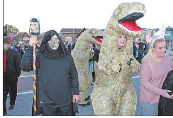
The 2017 Hometown Halloween on the Square was a huge, spooky success.