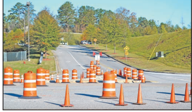
A view of the new right-turn only out of the Blairsville Walmart at Georgia 515.

The Georgia Department of Transportation has marked out a right-turn only lane using orange road barrels at the Georgia 515 exit of the Blairsville Walmart. These barrels effectively stop people from making a left out of Walmart and across the four-lane, all in the name of maximizing safety by minimizing the directions of traffic drivers must pay attention to. Fortunately, the large plastic barrels are only temporary, as GDOT will be working in the coming weeks on several big changes in that area. Union County Sole